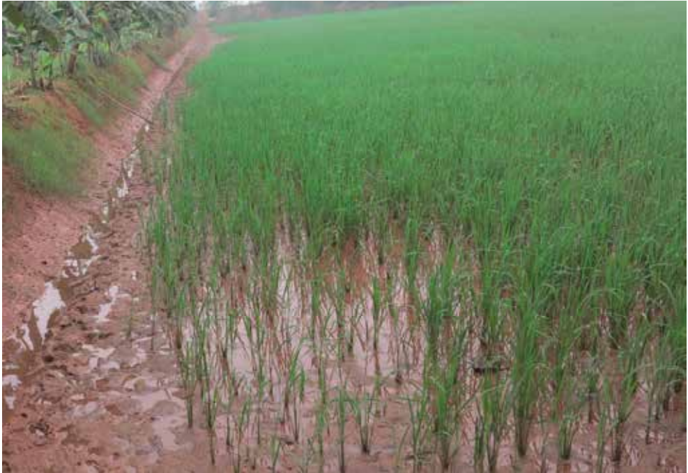
Fig. 6: Type locality of Augyles gigas .

Micilus minutissimus SAHLBERG, 1900: Yen Bai (MASCAGNI 2003). This records needs confirmation.