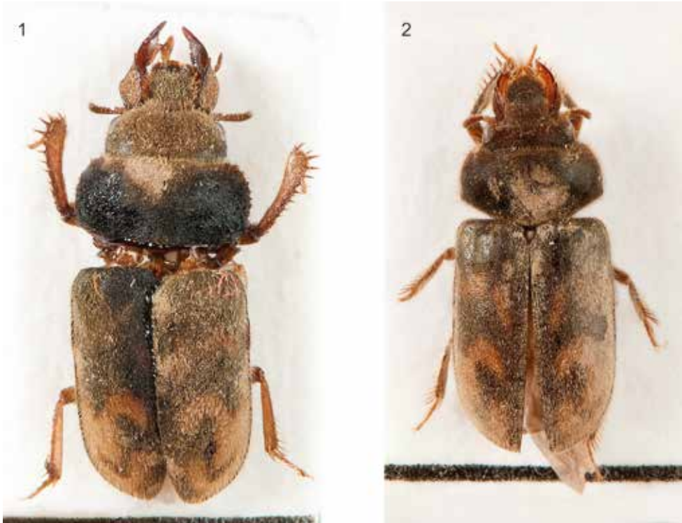
Figs. 1–2: Augyles gigas , 1) holotype, 2) paratype \alpha .